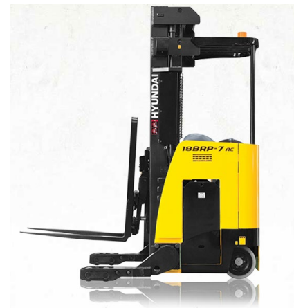
Photo may portray optional equipment not included in your quotation.

Mast 3-Stage (FSV) mast with full free lift. Mast specifications: Maximum Fork Height - 240" Overall Lowered Height - 107" Free Lift – 59" with standard Load Backrest